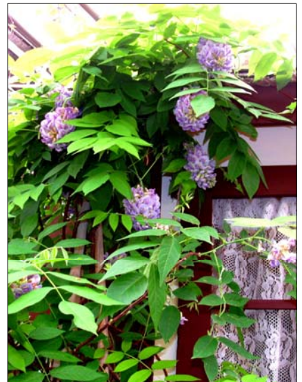
A great alternative- American Wisteria

The Management List consists of over 70 invasive plants. Although not as highly invasive as plants on the Do Not Sell List, it is recommended that these plants are not planted on Long Island, especially by county agencies or for homes near natural habitats. Species on the Management List are "moderately invasive" according to the independent scientific review committee.